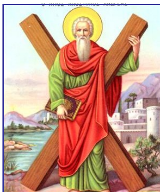
The feast day of St. Andrew is November 30th.

and began to preach the Gospel in Greece. It was in Achaia, Greece that he died for his faith by being crucified on a cross in the shape of an X—today called the cross of St. Andrew