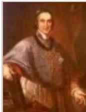
Bishop Pompallier led the oldest Catholic parish in New Zealand in 1840