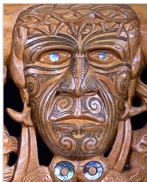
Head of Jesus in Maori culture, St Joseph Church in Jerusalem, New Zealand

You can volunteer to help others with their homework or give a hand to someone from another country wanting to learn our language.