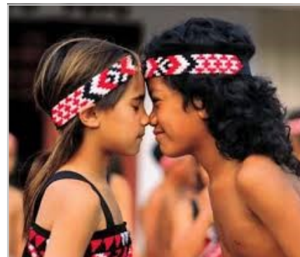
Traditional Maori greeting in New Zealand

No one has the right to harm or take advantage of another person so that they can have an excess of resources or possessions. Working for the Common Good means working for the day when the rights of all people are protected and respected and each member is able to fulfill his or her responsibilities to family, community and broader world. In particular, we must care for the vulnerable, children, the sick, the dying, the homeless and hungry, and all those who are marginalized.